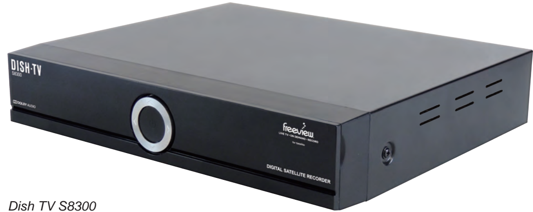
Dish TV S8300

Before setting up, please ensure that your Dish TV S8300 has the following components: